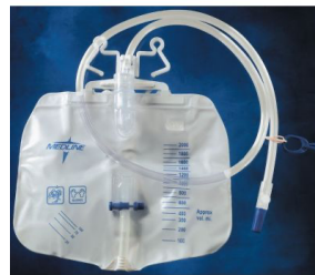
Two covers and the two different types of catheter bags.

It's a simple knit in the round with an open bottom and top – like a cowl -- but we pinched it together at the top and used buttons to keep it from slipping down to allow access. The buttons need to be placed on each side the plastic hanger and tube, leaving about a 4" opening. The care-givers will be able to either unbutton and slip the cover down to change it or lift it up to check it. The tube coming out of the top is tethered to the patient.